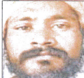
शव का मांस खाने वाला बाबा • चलाव कोले

सुनकर पुलिस के पैरों तले जमीन खिसक गई। पुलिस ने इनके बहन को भी पकड़ से जमाने से कहा ही चिता खुला रात था और उनका मांस निकाल लेता था। इवले मर्डर का